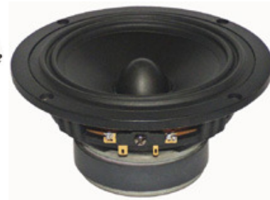
5" PPM WOOFER