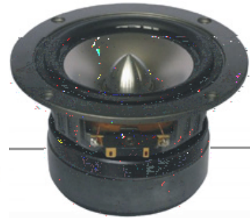
4" TI FULL RANGE