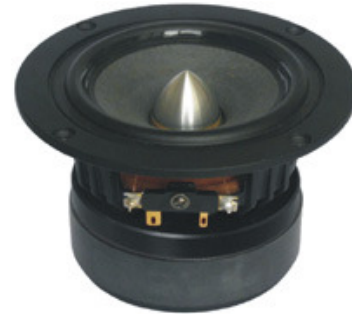
4" PAPER FULL RANGE