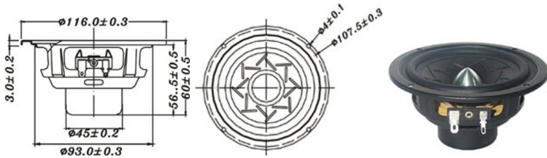
4" PP FULL RANGE