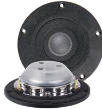
1" TITANIUM DOME / NEODYMIUM